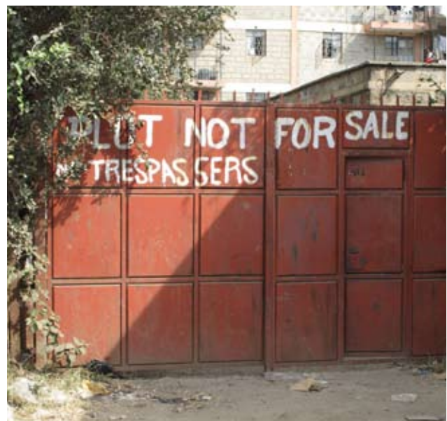
Plot holders in Nairobi are being forced to put up signs that their plots are not for sale