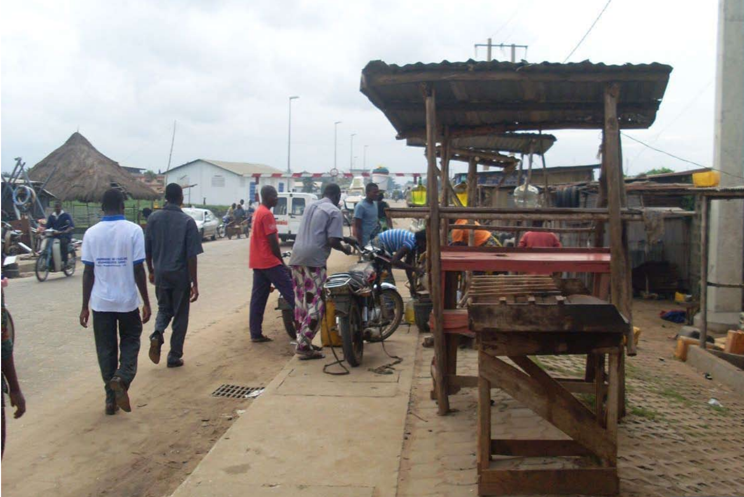
A motorcyclist fills up at a roadside petrol station