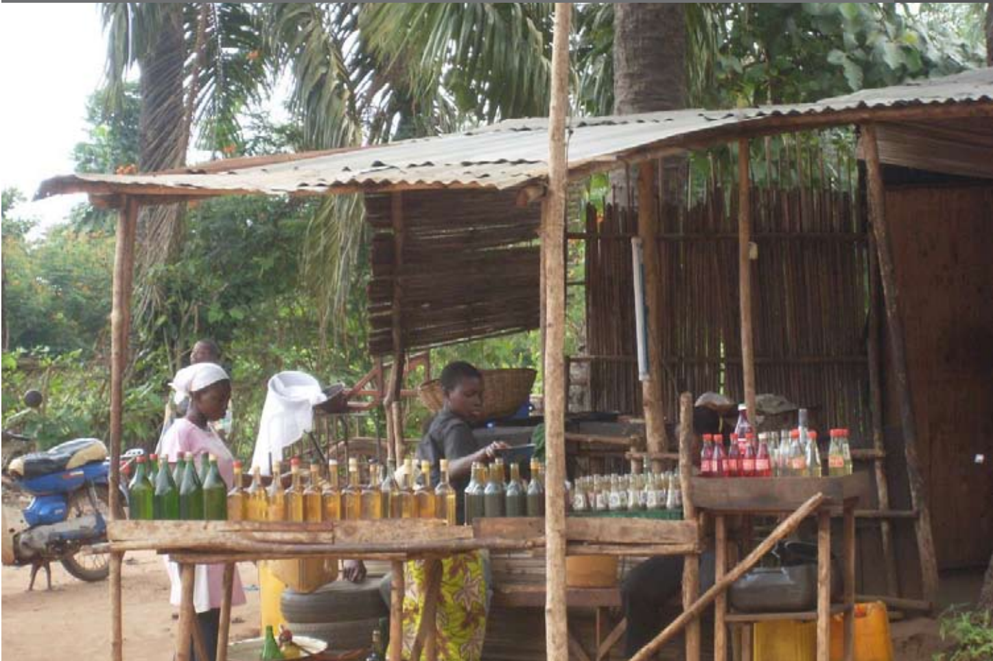
Petrol on sale on the road side in Cotonou