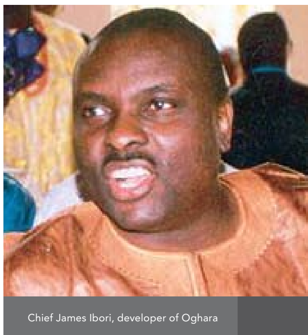
Chief James Ibori, developer of Oghara

The EFCC says these charges only relate to money laundering for which he is also being sought by the British police.