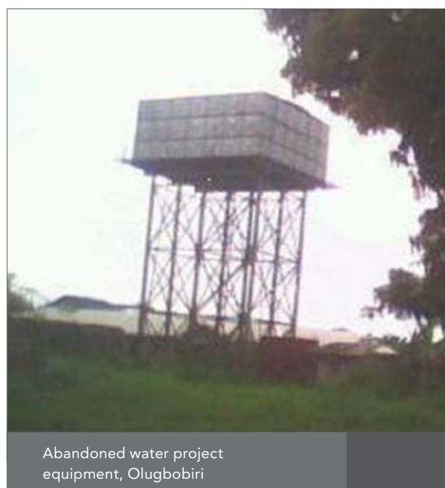
Abandoned water project equipment, Olugbobiri

The one project emanating from the rebels' armed struggle that is of real use to the locals is the road in Olugbobiri. It is the only passable road in the area and it was constructed by workers paid by rebel leader Joshua McIver, who got AGIP to give his rebel army the contract to do the work. Though it cannot pass for a modern tarred road, its quality