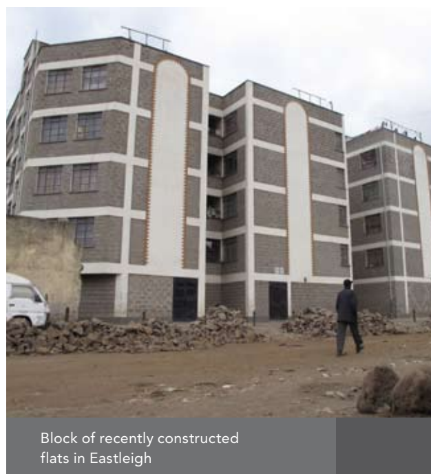
Block of recently constructed flats in Eastleigh